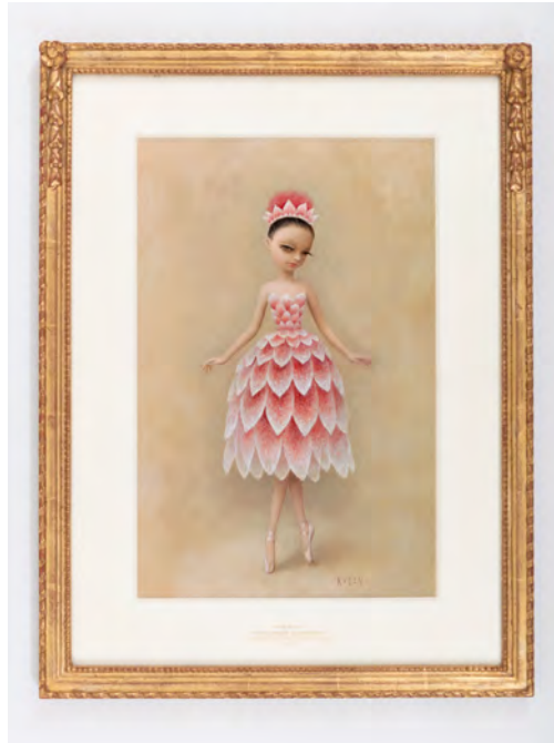
TEA FLOWER ALTERNATE , 2016, OIL ON PANEL, 17" X 11".