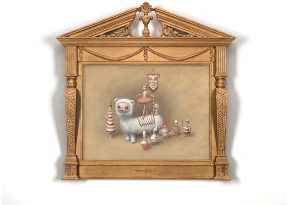
PRINCESS PRALINE'S PROCESSION, 2016, OIL ON PANEL, 17 1/2" X 23 1/2".