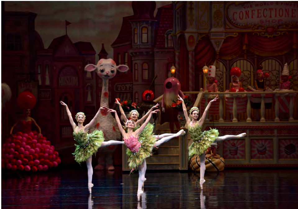
Scene from "Whipped Cream."