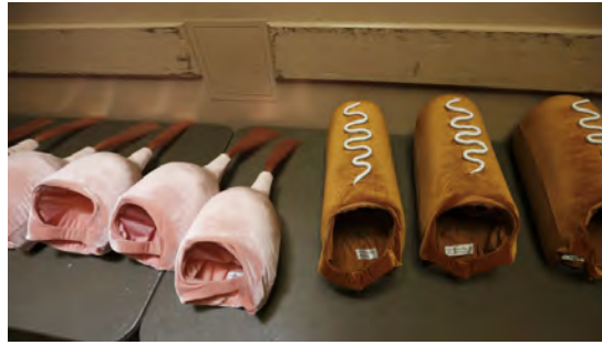
These cavity-inducing hats will be worn in American Ballet Theatre's production of "Whipped Cream," a reworking of a Richard Strauss ballet.