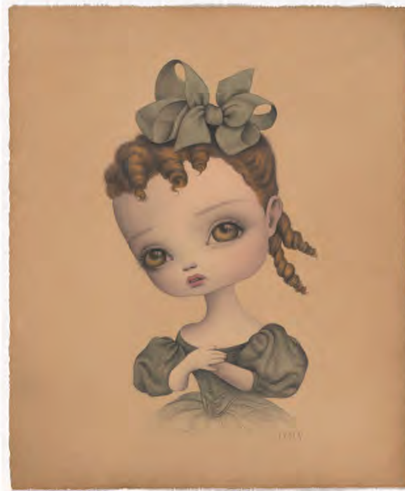
MARK RYDEN, DAISY, 2010.

You don't have to invent a movement to be considered its ambassador; you just have to be the best at it—or at least its most popular practitioner. And painter Mark Ryden, whose first major solo show in seven years, "The Gay 90s Olde Tyme Art Show," opened last week at Paul Kasmin Gallery, has long been considered the godfather of Pop Surrealism because his work inhabits both arenas. His deeply devoted followers range from obscure goths, steampunks, and cultish Victoria-philes to celebrities like Leonardo DiCaprio and Jake Gyllenhaal; his work has graced the covers of books (Stephen King) and records (Ringo Starr,