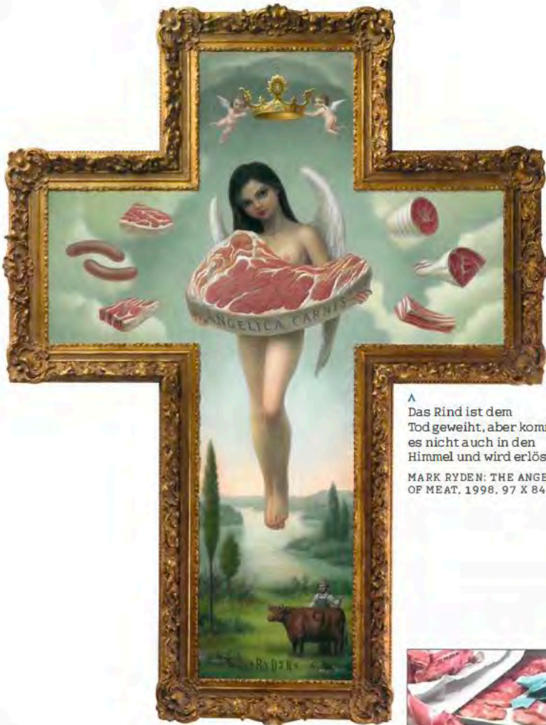
A Das Rind ist dem Tod geweiht, aber kommt es nicht auch in den Himmel und wird erlöst? MARK RYDEN: THE ANGEL OF MEAT, 1998, 97 X 84 CM

> Schlüsselerlebnis: Auf dem Fleischmarkt in Athen sah der Maler Erschütterndes – und teilte es mit seinen Followern INSTAGRAM-POST VON MARK RYDEN, 2017