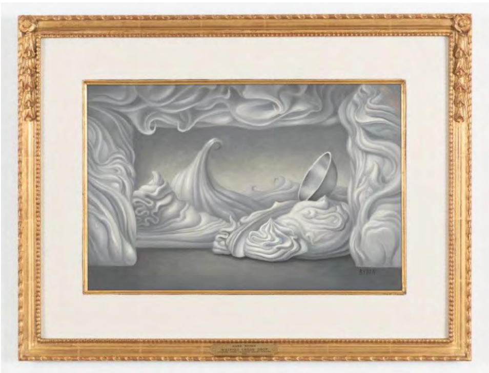
Mark Ryden, Whipped Cream Drops, 2017. Oil on panel. 26.7 x 40.6 cm.