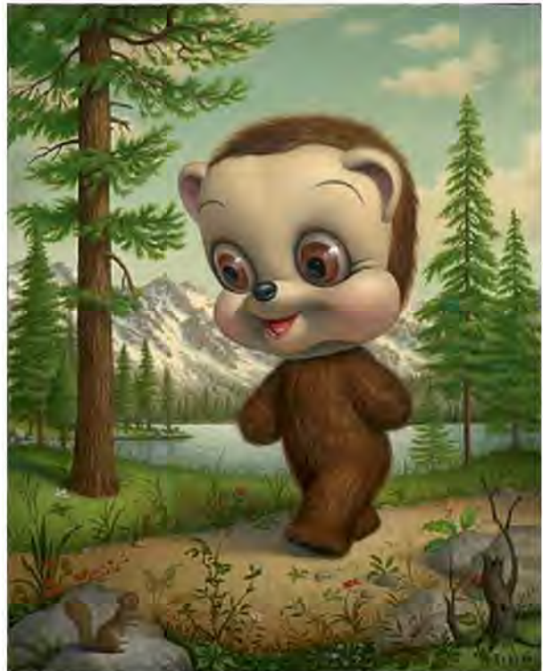
California Brown Bear, 2006

"Do you know Bouguereau?" he asks. "He's one of the most hated artists ever. He's also one of the most skilled artists ever. He paints flesh better than any artist, I feel. I don't think his paintings are the best paintings ever. His content is peasant girls, beautiful peasant girls, and it offends so many people, so many people just hate him with a passion — but they're painted so well. Especially for an artist, to look at just that application of paint mimicking flesh — it's just mind-boggling, how amazing it is. People now want to know how to do that, they can appreciate it."