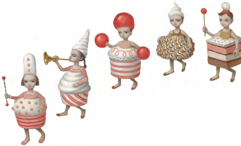
Sketches by Mark Ryden.

Mr. Ryden's fantastical designs, he added, had been a great help to him in creating the piece. "The score is wonderful, and there are amazing waltzes, gallops, polkas and a beautiful violin adagio, but it's challenging because not all of it is danceable," he said. "Parts are very symphonic, and when the music is saying something that I perhaps can't translate into movement, we have these huge heads and amazing backdrops to balance things."