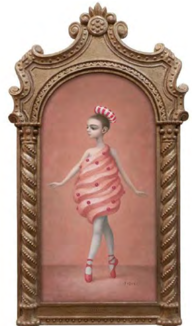
Mark Ryden, Swirl Girl , 2017. Oil on panel. 28.6 x 59.1 cm.