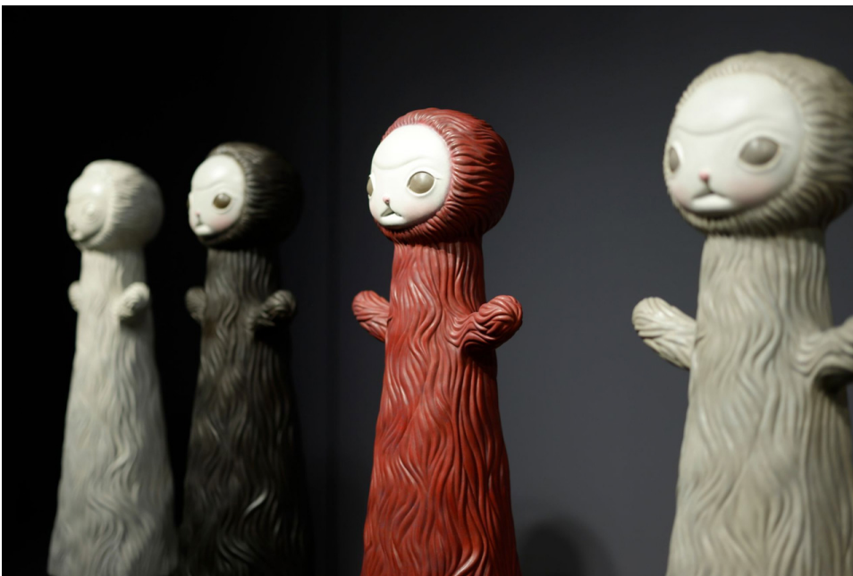
Exhibition views of 'Yakalina 9' at Perrotin Tokyo.

The exhibition continues the artist's exploration into the invisible order of the universe, in which the animal evokes a feeling of awe and mystery within the viewer. According to a statement, Ryden believes that "if you ask for your animal spirit, it will come to you. Close your eyes, look inward, and ask your animal guide to come, then keep your eyes open for a visitation."