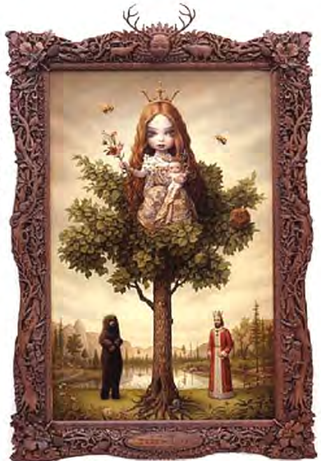
The Tree of Life, 2006

There are numerous artists who enjoy some degree of crossover but few who straddle the divide quite as cleanly as Ryden. Combining the pictorial accessibility of Lowbrow with the weight of art-historical awareness, layering seductive technique over an increasingly mystical conceptual framework, Ryden makes work that plays by both sets of rules, without, impressively, seeming to bow to either.