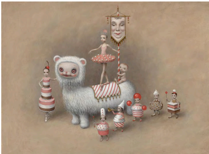
Princess Praline's Procession by Mark Ryden, who will create the sets and costumes for a new American Ballet Theatre piece by choreographer Alexei Ratmansky.

Pop surrealism is coming to the ballet stage: Visual artist Mark Ryden, known for fantastical oil paintings, will create the sets and costumes for a new ballet by choreographer Alexei Ratmansky, American Ballet Theatre announced Wednesday.