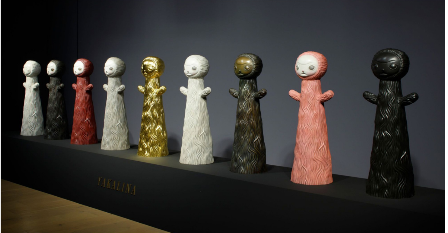
Exhibition views of ‘Yakalina 9’ at Perrotin Tokyo.

This past weekend, Perrotin and Kasmin Gallery unveiled a joint exhibition of new works by American artist, Mark Ryden. Well known for his Pop Surrealist aesthetic that often depicts Victorian characters in eery dreamlike scenes, the artist introduces a mysterious new character called Yakalina.