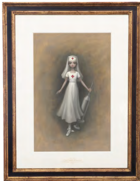
NURSE CORPS DE BALLET , 2016, OIL ON PANEL, 17" X 11".