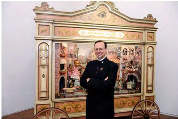
Mark Ryden.