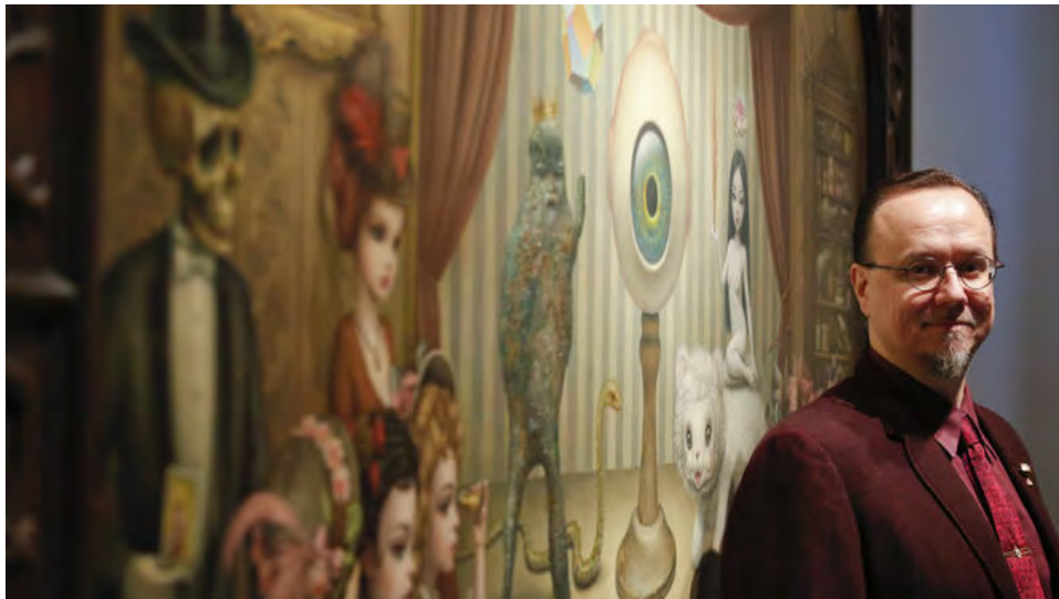
Mark Ryden, junto a 'The Parlor-Allegory of Magic, Quintessence, and Divine Mystery' (2012), en el CAC Málaga.

Sentado junto a su mujer, Marion Peck, y ante un té que le acaban de servir, Mark Ryden (Meford, Oregón, 1963) revela durante la conversación un humor fino y sutil. En su forma de expresarse, al igual que en sus obras, los detalles revelan a menudo más que los contenidos más gruesos.