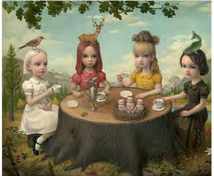
Allegory of the Four Elements, 2006

At 3 p.m. on Saturday, midway through the opening, a line stretched out the back door, down Crescent Heights and around the corner onto Beverly. By the time the gallery closed its