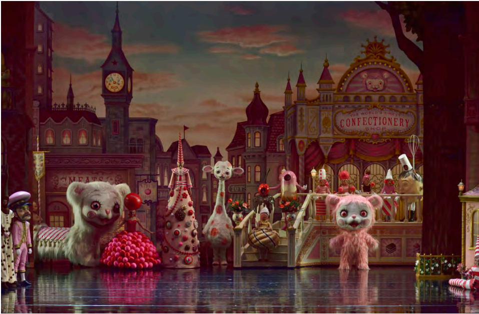
Scene from "Whipped Cream."