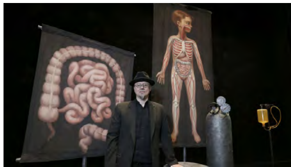
Painter Mark Ryden, known for his vaguely unsettling fairy tale images, has designed sets and costumes for American Ballet Theatre's production of "Whipped Cream."