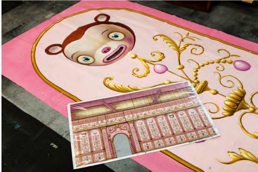
Backdrops by Mark Ryden being prepared.

existence of a ballet score by Strauss, which hadn't been used, really excited me. The story is almost nothing; it's not exactly Tolstoy. It's about a little boy who eats too many sweet things, ends up in hospital and has nightmares that lead him into a fantasy world. But the music is wonderful, rich waves of sound, 10 things going on at once."