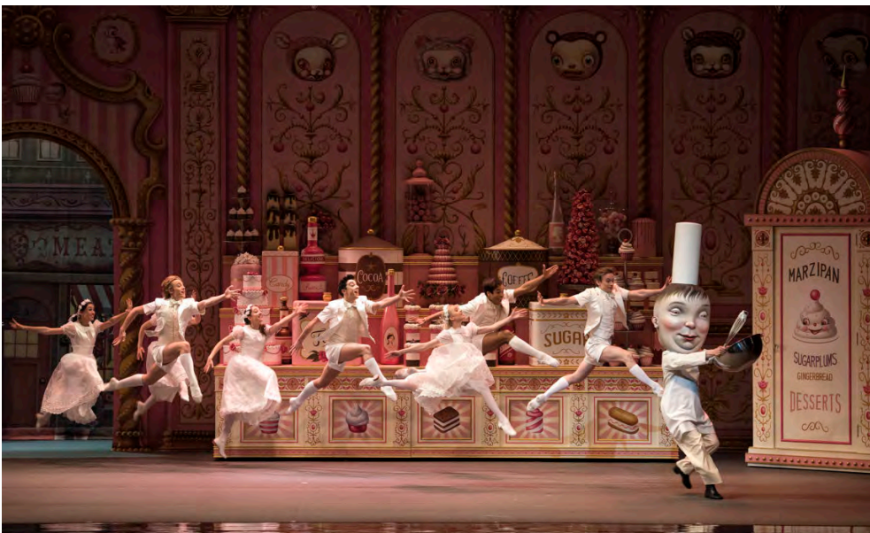
Scene from "Whipped Cream."