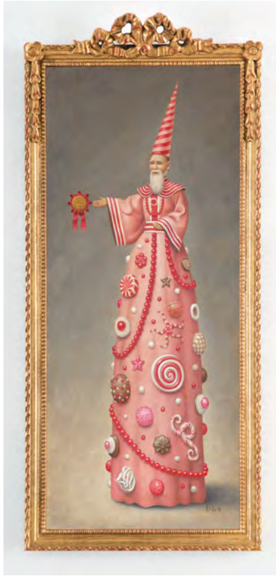
NICOLO , 2016, OIL ON PANEL, 26" X 11".