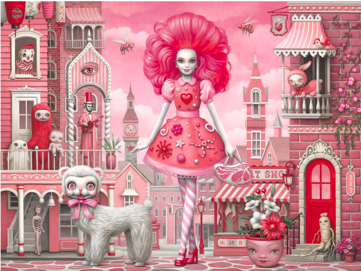
Mark Ryden, Pink Pop Barbie, 2021, oil on panel, 28 3/4 x 39 inches.

Artist Mark Ryden has developed a series of Barbie artworks and limited-edition dolls in partnership with toy company Mattel. The artworks will be exhibited in a solo show entitled Pink Pop at 8382 Melrose Avenue in Los Angeles from 11 November to 11 December. 'Barbie has made appearances in my art for a long time,' Ryden said in a statement. 'The body of work in the Pink Pop exhibition are my own new personas for her.'