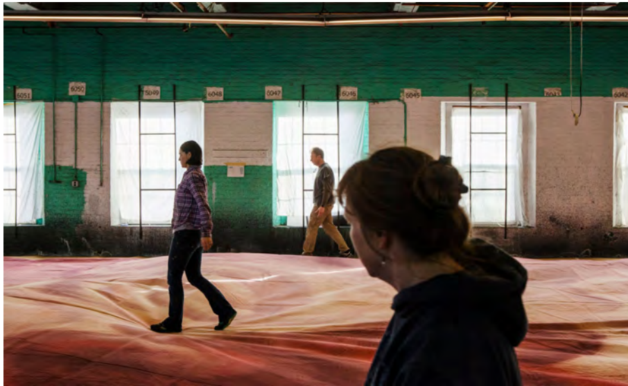
The pop-surrealist artist Mark Ryden's backdrops for the ballet "Whipped Cream" being prepared at Scenic Art Studios in Newburgh, N.Y., in December.

A Viennese pastry shop, dancing sweets, a little boy who overindulges and a revolution by the lower pastry orders. An almost unknown Richard Strauss score. Décor and costumes by the pop-surrealist artist Mark Ryden. And a great title: "Whipped Cream! It's really wonderful," Alexei Ratmansky said of his full-length work for American Ballet Theater after a long day of rehearsal last week.