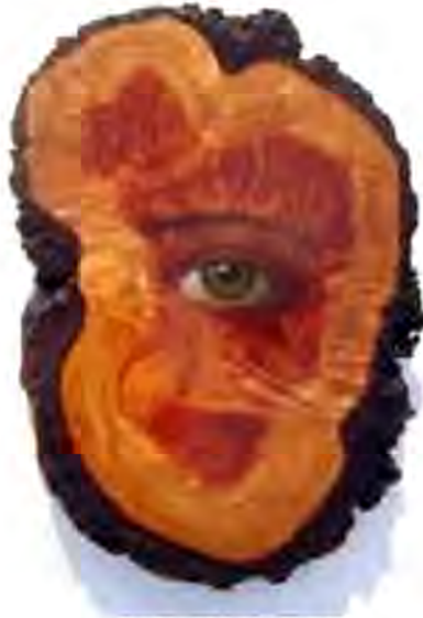
Redwood Spirit I, 2006