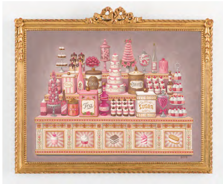
DESSERT COUNTER, 2016, OIL ON PANEL, 18" X 24".