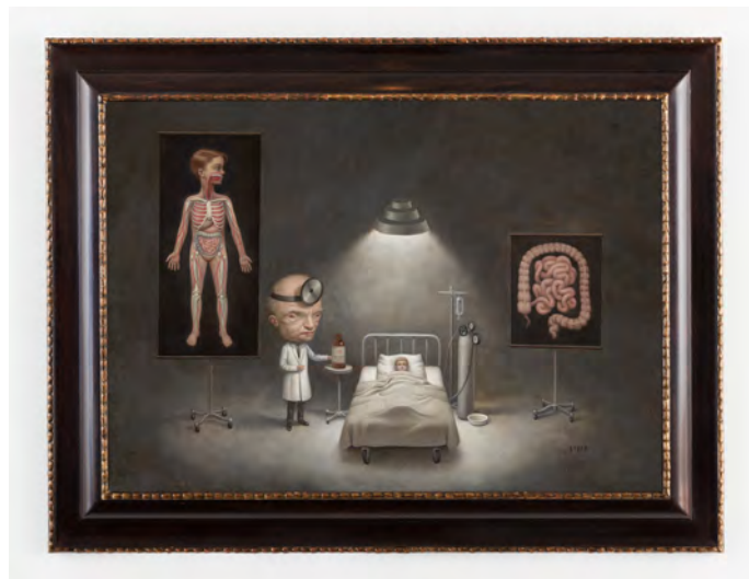
MARK RYDEN, HOSPITAL , 2016, OIL ON PANEL, 23 X 32 INCHES