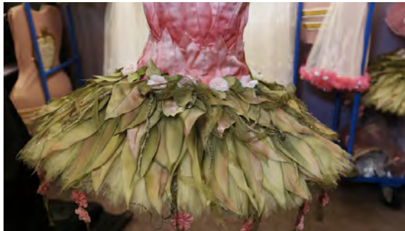
Characters in "Whipped Cream" include Princess Tea Flower, who wears this costume.