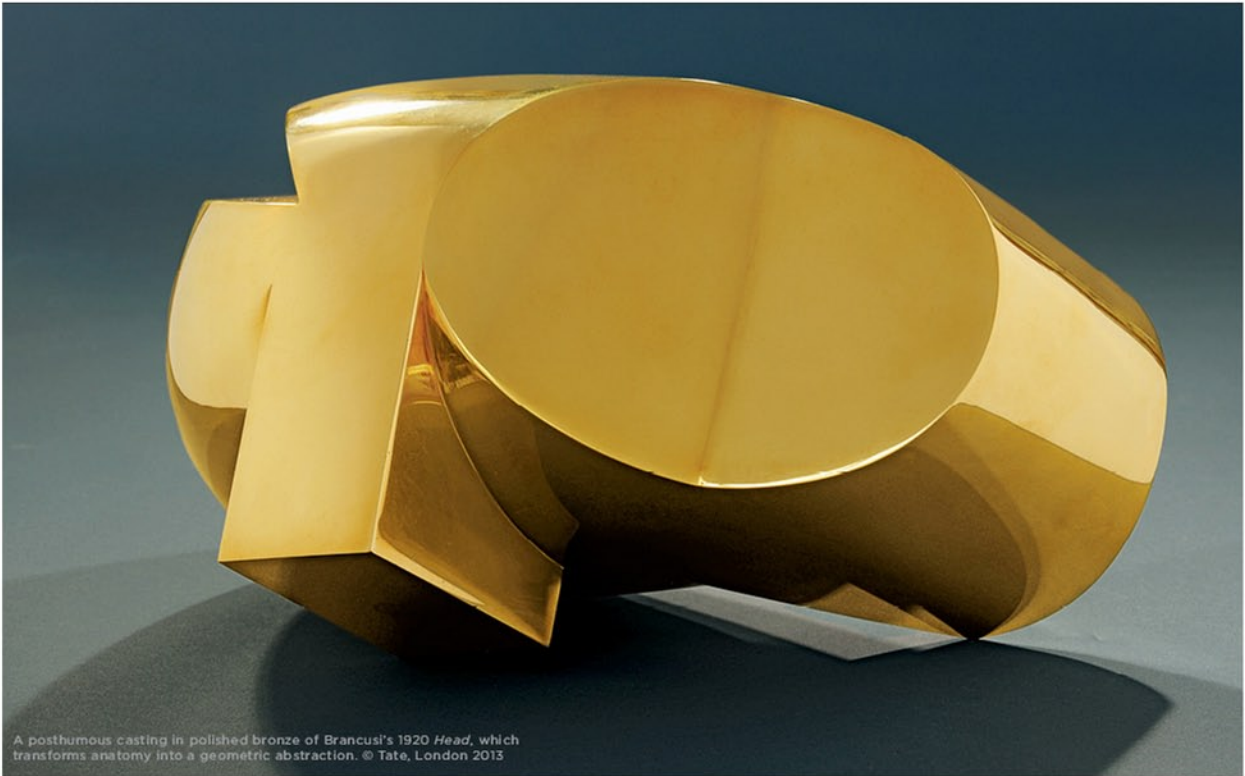
A posthumous casting in polished bronze of Brancusi's 1920 Head , which transforms anatomy into a geometric abstraction.